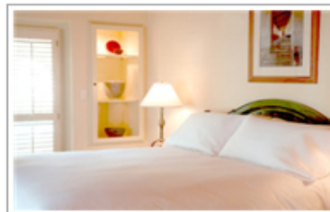
Borrego Ranch Resort and Spa

A retreat to Borrego Ranch Resort & Spa in Southern California's Anza-Borrego Desert could be just the thing to cure the winter doldrums this year, and if you book by November 1, you'll save 20% on standard rates through the end of the year.